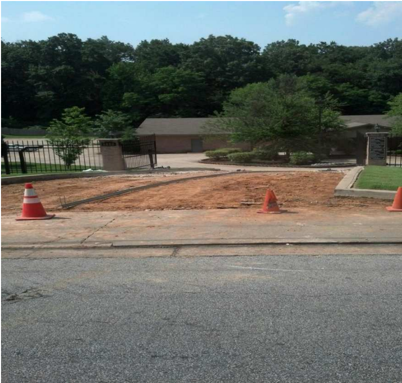
Entrance view of the jobsite.

This is a pictorial example of how the use of a figure 8 loop configuration could cure an issue where an AC power conduit is running through an area where a loop needs to be placed.