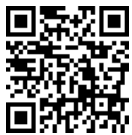
DSP-55 Web Page