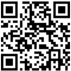
AVI-40 Web Page

For current information on all of our products. Specifications are subject to change.